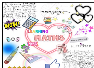
Amelie C - TRRE year 7