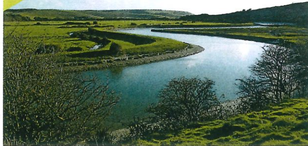
The Cuckmere River winds its way south of Alfriston.