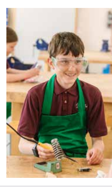
"My son is so keen to come to school each day. He's up, ready and dressed proudly in his uniform before we get up." Parent comment