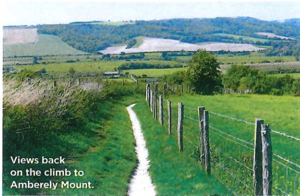
Views back on the climb to Amberley Mount.